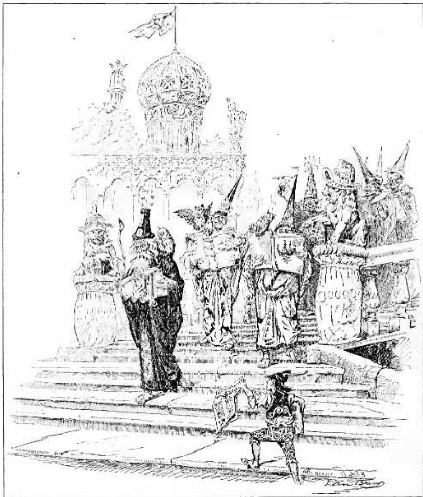
THE COUNCILORS RETURN TO THE PALACE WITH THEIR REPORTS. (SEE PAGE 148.)