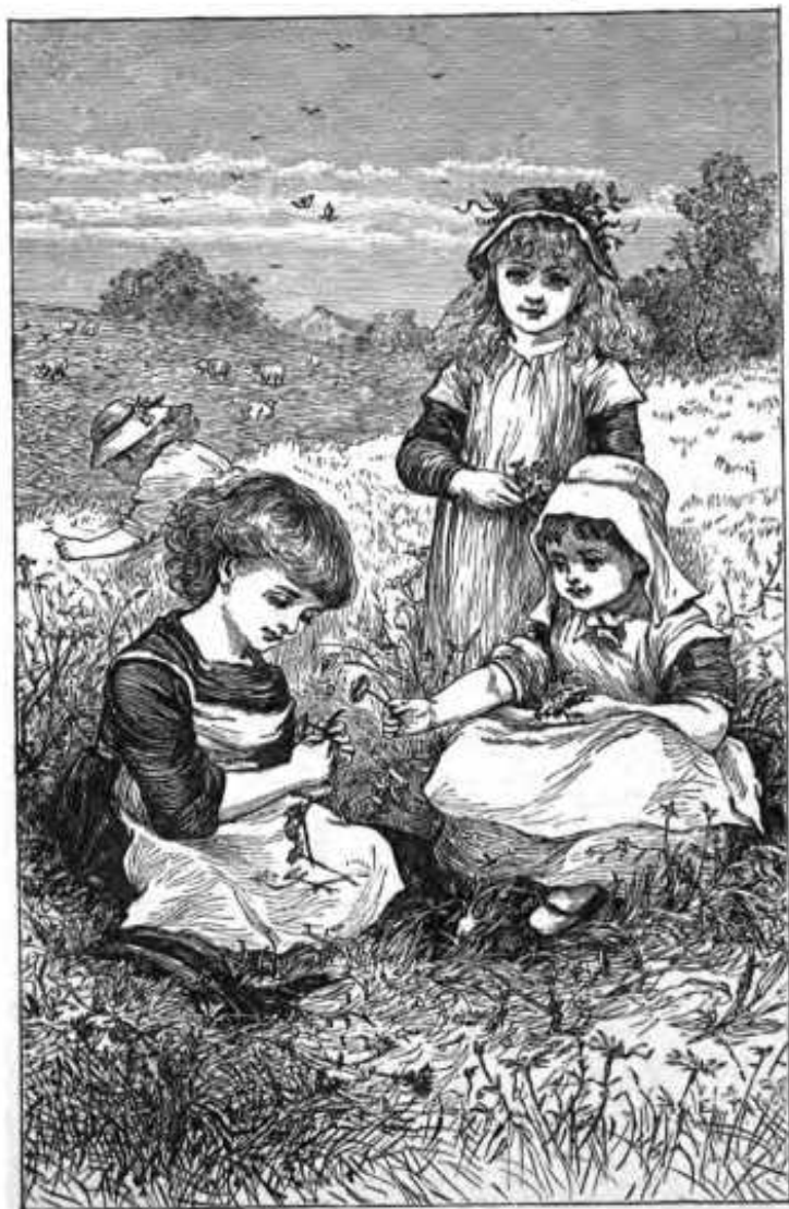
MAKING DAISY CHAINS. Page 35.