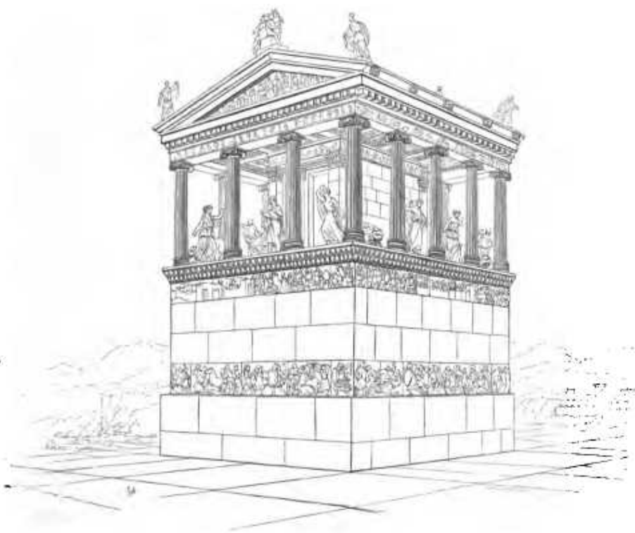
THE NEREID MONUMENT OF XANTHOS: RESTORED BY SIR CHARLES FELLOWS.