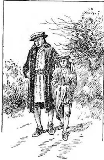
COLUMBUS AND SON ON THE WAY TO LA RABIDA.

The Man and Boy. —Many, many years ago, on a sunny autumn day, a man and a boy walked along a dusty road in the south of Spain, as you may have often seen people walk on our own roads. The man was tall and strong, but he looked as if he had come far and was tired. The boy, dusty and hungry, held fast to his father's hand as he walked along by his side. This was very long ago, more than four hundred years in the past, and millions on millions of men and boys of whom we have never heard have died since then. But the story of that day will not soon be forgotten, for it is told in a hundred books