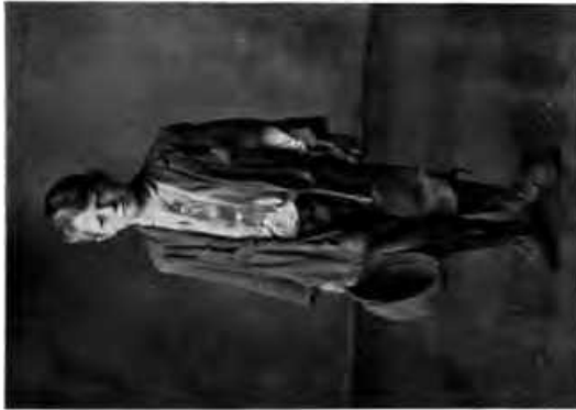
JESI OUT OF JAIL