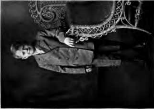
AFTER A BATH AND CHANGE OF CLOTHING

A deserted, homeless and penniless nine-year-old boy, who, in December, 1911, in a town of less than eight thousand, crept into a grocery store, by a side entrance, and got something to eat, was arrested and placed in the county jail