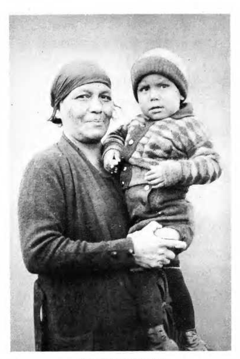
Modern Indian Mother and Child