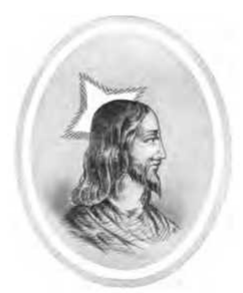
JESUS CHRIST This picture is the oldest known, found on a Tomb in the Catacombs.