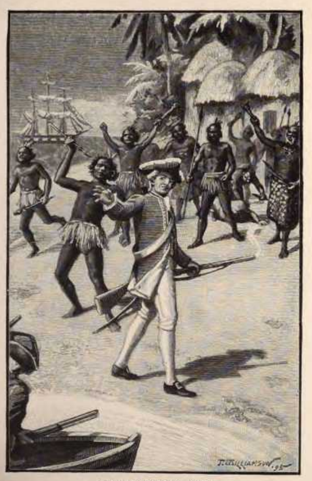
DEATH OF CAPTAIN COOK