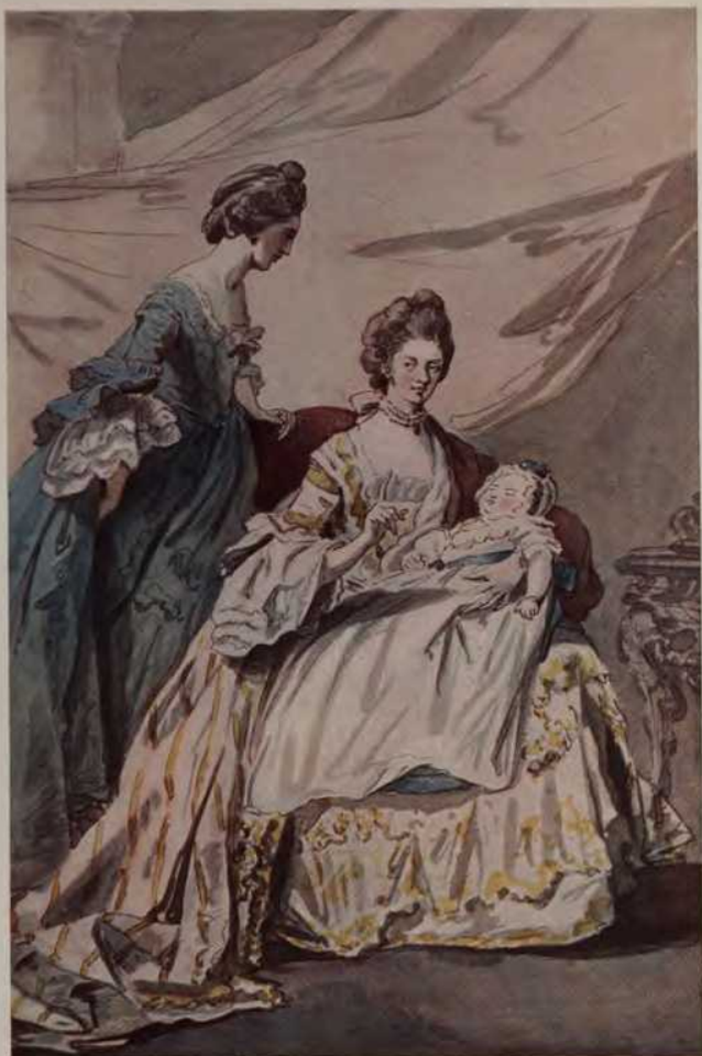
QUEEN CHARLOTTE WITH THE PRINCESS ROYAL, AND THE DUCHESS OF ANCASTER. From a Water-colour Drawing by Francis Cotes, R.A. British Museum.