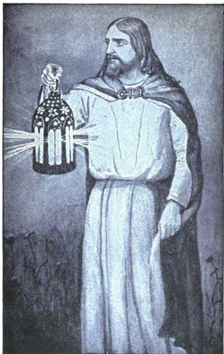
THE LIGHT OF THE WORLD.