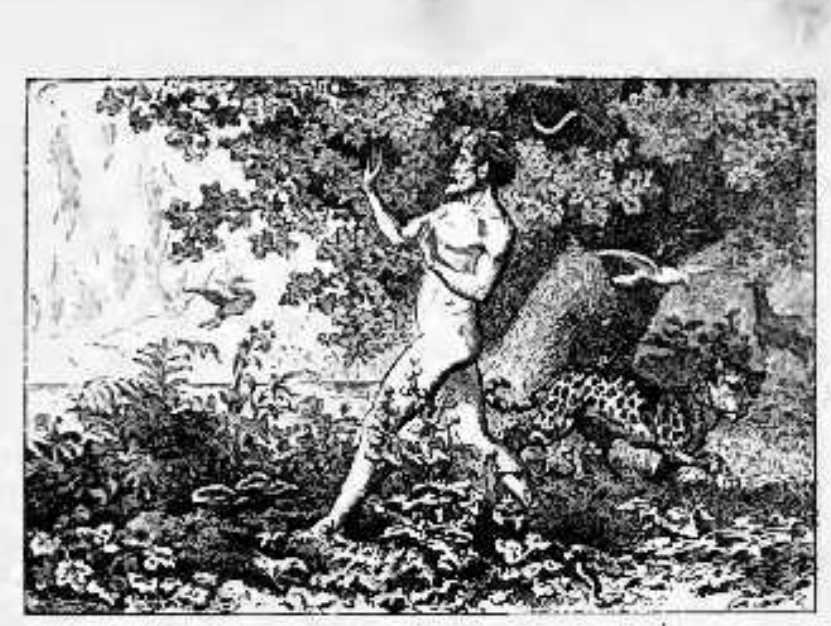
THE GARDEN OF EDEN.