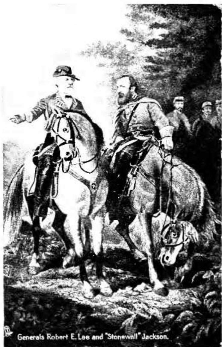
The Leaders of the Southern Army, which killed, wounded and captured more men out of five consecutive armies pitted against them, than their army contained.