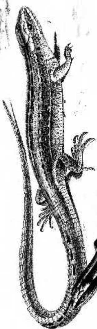
1 Sand Lizard.