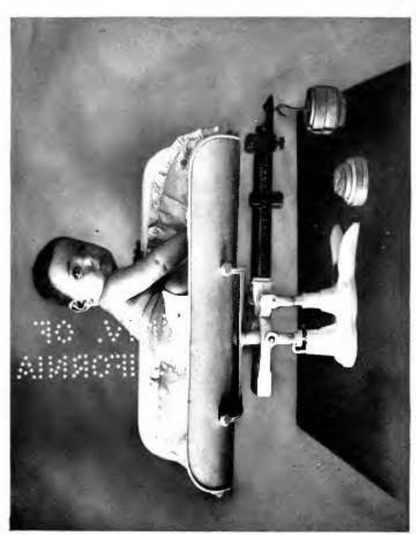
Country of The Frithanke Company, Special Scale Foundation Company, Special Scale Foundation (Indicating quarter connecting to 35 pounds)