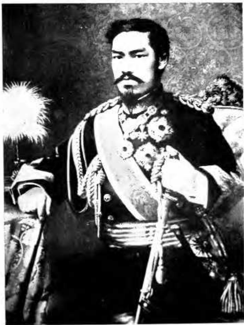
The Emperor Mutsu Hito