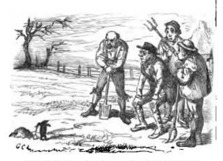
'We shall learn of him another and a greater lesson, some day.'