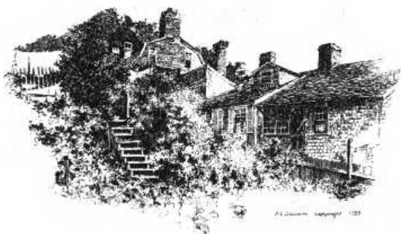
OLD HOUSES in Plymouth.