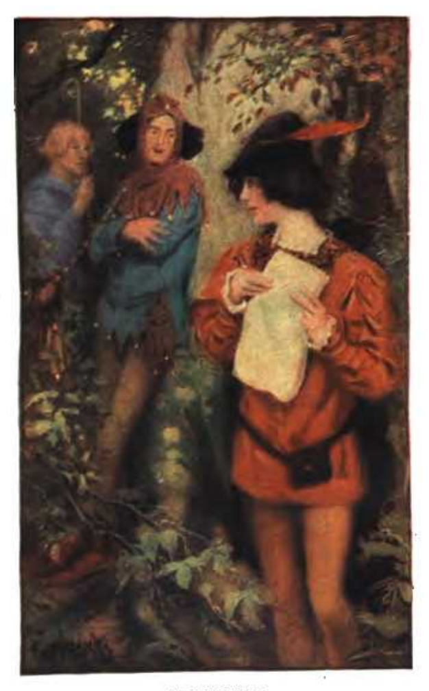
TOUCHSTONE "I'll rhyme you so eight years together"