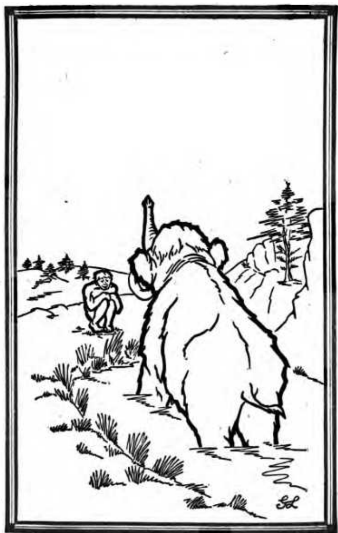
GONCH AND THE MIBED MAMMOTH