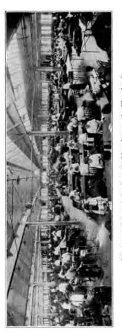
Modern edition of the first clothing factory in Cleveland