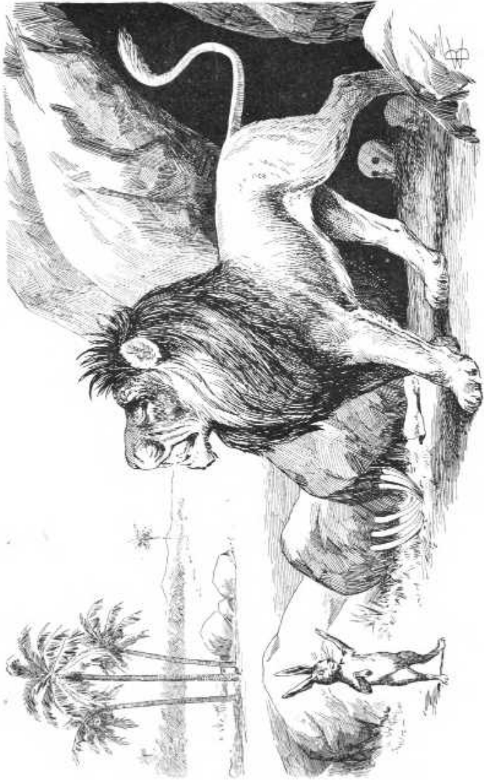
THE DWELLER IN A DARK CAVE.