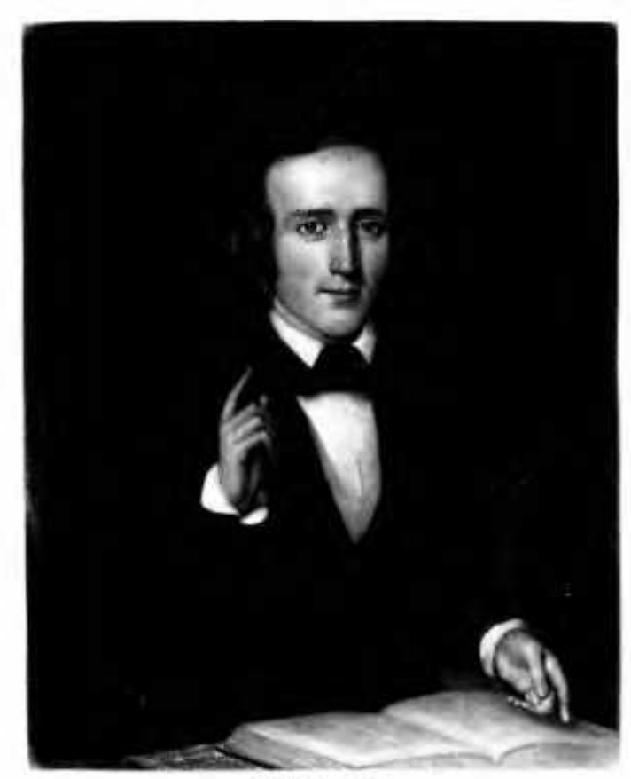
WANTED AN ARTSO