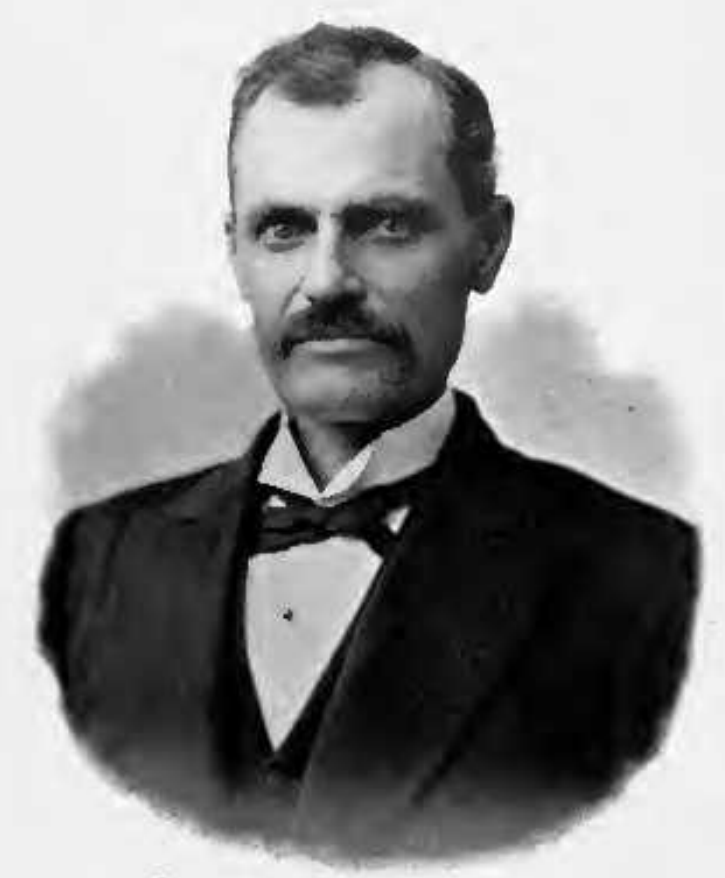
Sincerely yours 3.7. Griffin