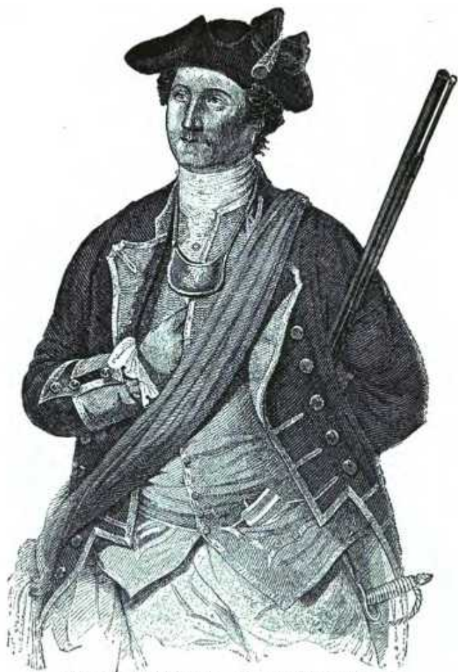
WASHINGTON IN 1772, AT THE AGE OF FORTY.