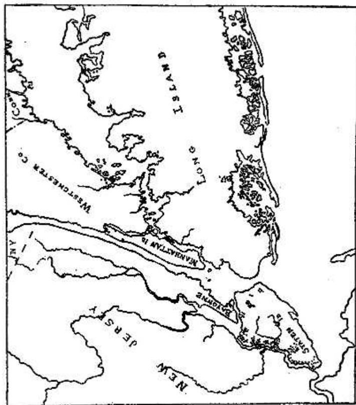
Map giving the location of Shell Deposits. Those marked * have been explored by the writer.