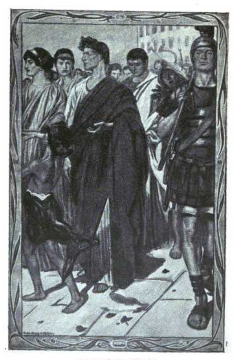
DEWARE THE IDES OF MARCH.