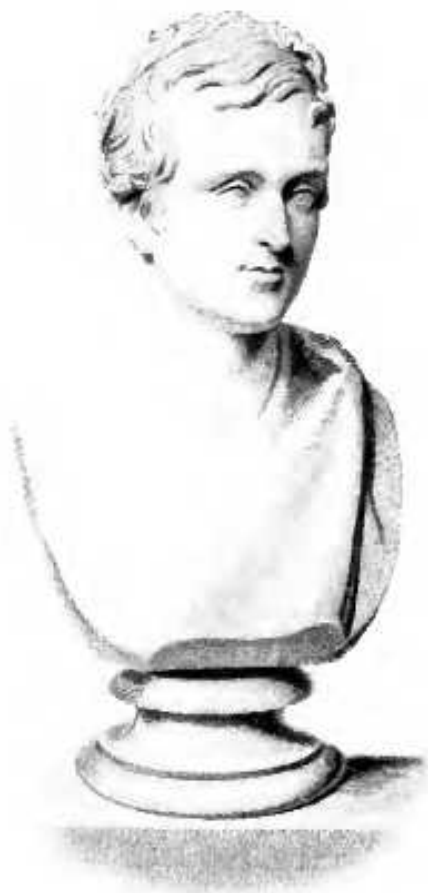
ARTHUR H. HALLAM