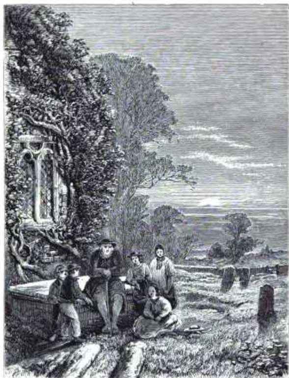
AN OLD MAN, SITTING ON A TOMBSTONE, TELLS THE STORY. Front.