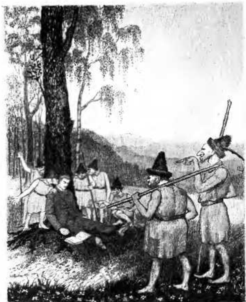
WHISPERED MALICIOUS TALES INTO HIS EARS.