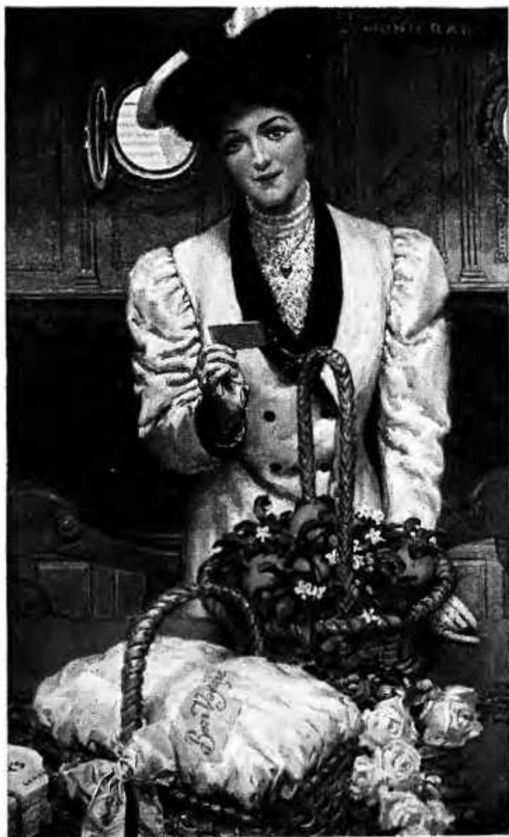
"FRUITS AND FLOWERS WERE SHOWERED UPON US"—Page 3