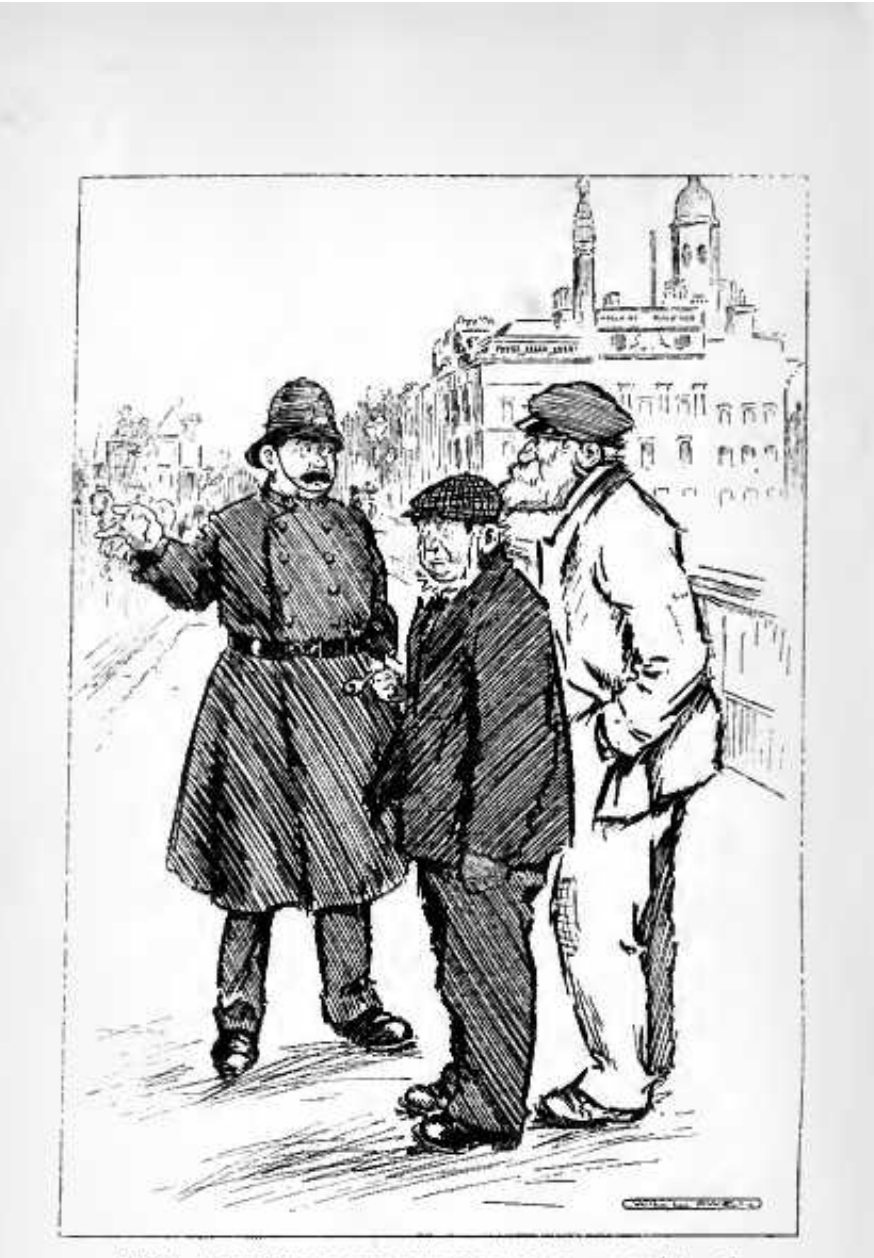
ASKED A POLICEMAN THE DISTANCE TO CLAPHAM (p. 209) Frontispiece