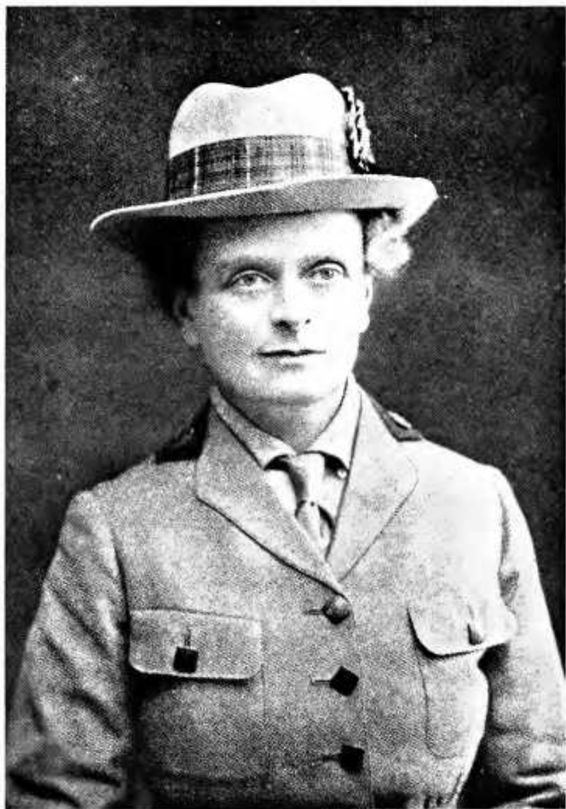
DR. ELSIE INGLIS, 1916