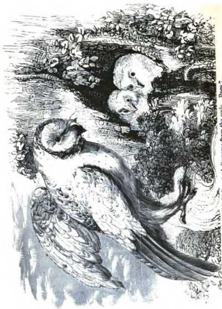
The Whit Hollow took its name from the owls. Page 7.