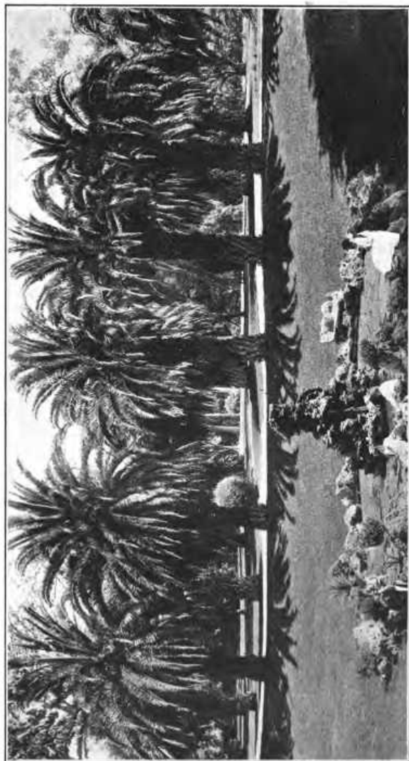
GRACEFUL DATE PALMS AT PALMDALE, MISSION SAN JOSE. THIS PRIVATE ESTATE CONTAINS SOME OF THE FINEST EXAMPLES OF TREES, FLOWERS AND SHRUBS FROM BOTH TROPIC AND TEMPERATE ZONES