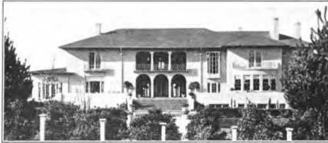
A RESIDENCE ON THE HEIGHTS OVERLOOKING OAKLAND AND SAN FRANCISCO BAY

I MAGINE a sunny and well-watered land of plains, hills and valleys, in area more than one-half as large as the State of Rhode Island, and lying on the east shore of the beautiful Bay of San Francisco—that is Alameda County. It is California's third county in population and taxable property—only the County of Los Angeles and the City and County of San Francisco showing greater totals in these particulars. Like all Gaul, the county may be divided in three parts: