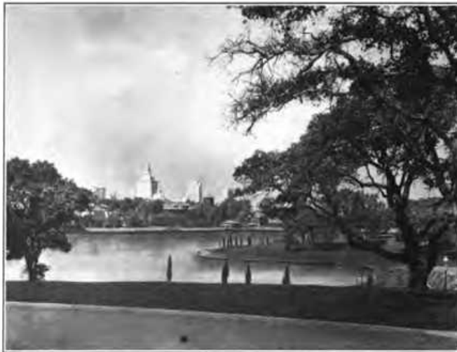
CITY HALL, OAKLAND, LOOKING ACROSS LAKE MERRITT

County proves that never does the temperature, winter or summer, fall to a point that is dangerous to delicate foliage. But, on the other hand, unlike many other regions where the orange and lemon flourish, never does the climate of Alameda County reach extremes of heat. The waters of San Francisco Bay are cool, and even on the sunniest day of the year there is a lingering coolness in the air from the wide spaces of the Bay. The fogs which gather along the coasts of the Pacific and roll over the sea-fronting hills seldom penetrate as far inland as the borders of the county. Even when fleecy fog gathers along the levels nearest the Bay, it usually has lost a large part of its dampness and chill. For a climate that conduces both to work and play—which is never so warm as to be enervating and never too cold for comfort—it is confidently affirmed that the climate of Alameda County realizes the absolute ideal.