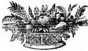
ILLUSTRATION TO VOL. XVI