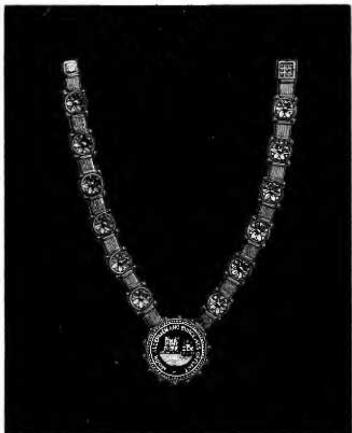
THE MAYOR'S CHAIN.