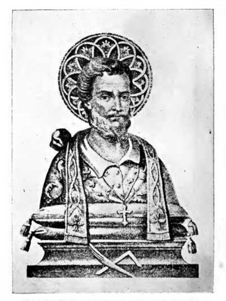
SILVER BUST OF THE APOSTLE THOMAS AT ORTONA IN ITALY.