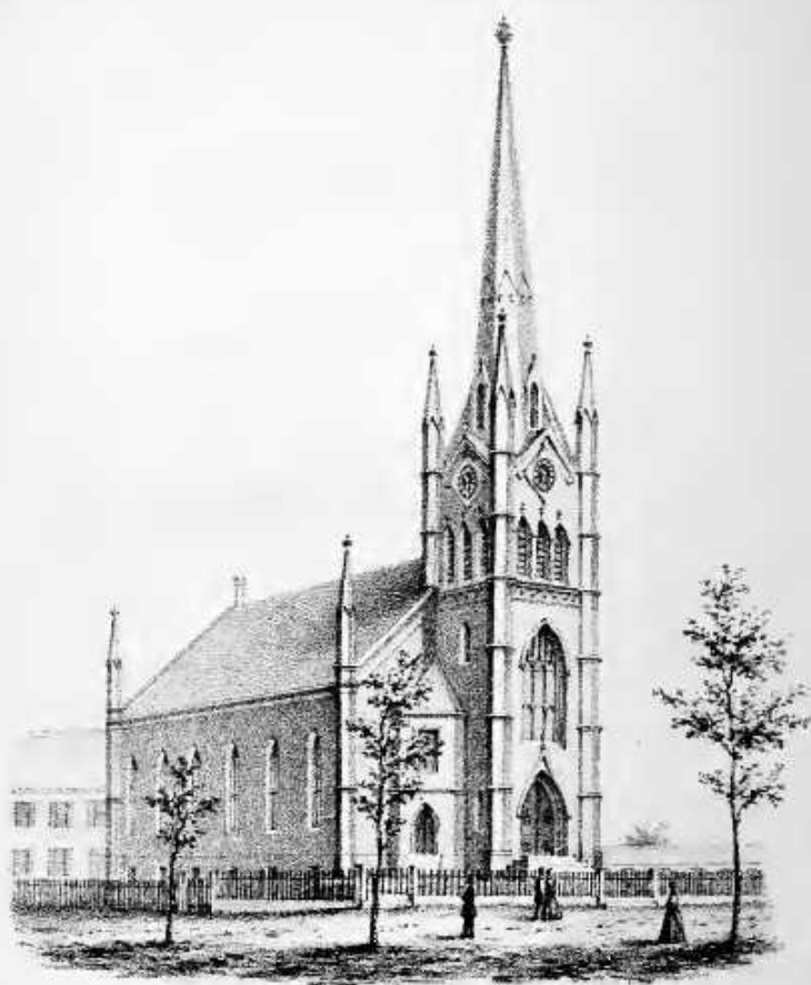
FIRST CONGREGATIONAL MEETING-HOUSE, NANTOK.