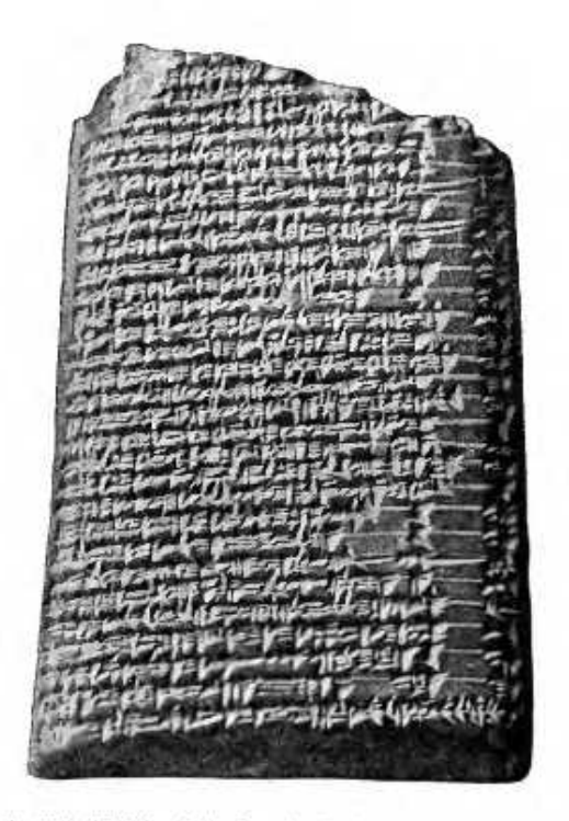
Part of the Third Tablet of the Creation Series (Brit. Mus., No. 93,017).