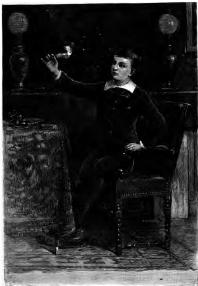
WASTING MONEY. (See p. 128.)