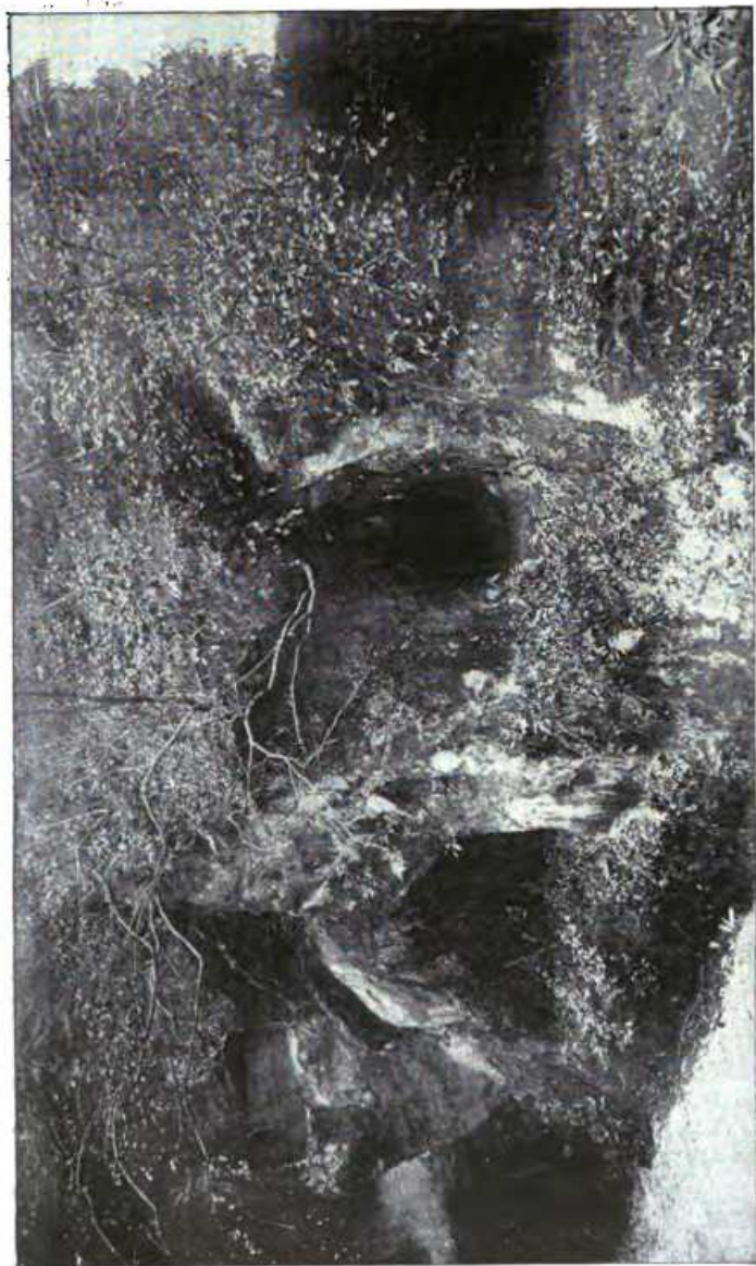
CAVES IN KAWACHI.