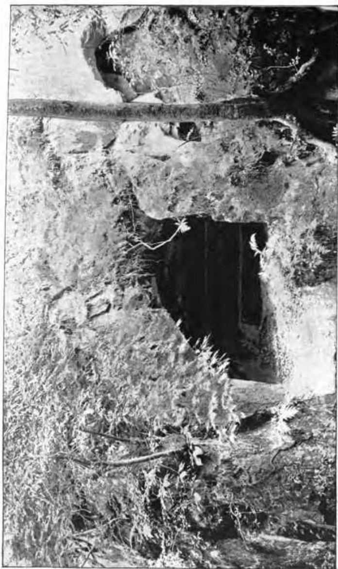
CAVE SHOWING REMAINS OF STONE COFFIN.