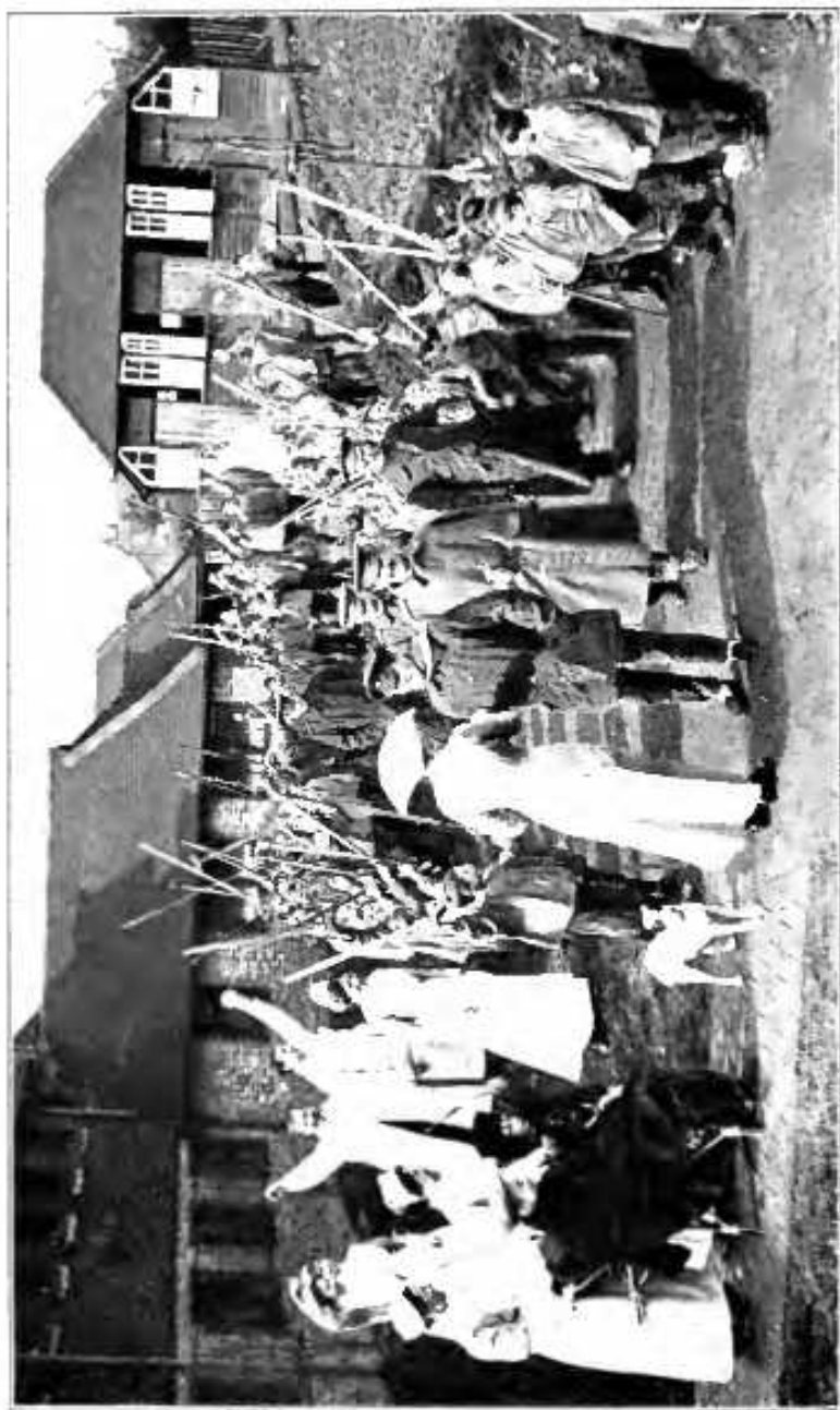
Home Again. Wounded British soldiers welcomed by crippled boys at the Heritage Crafts School, Chislehurst, Sussex