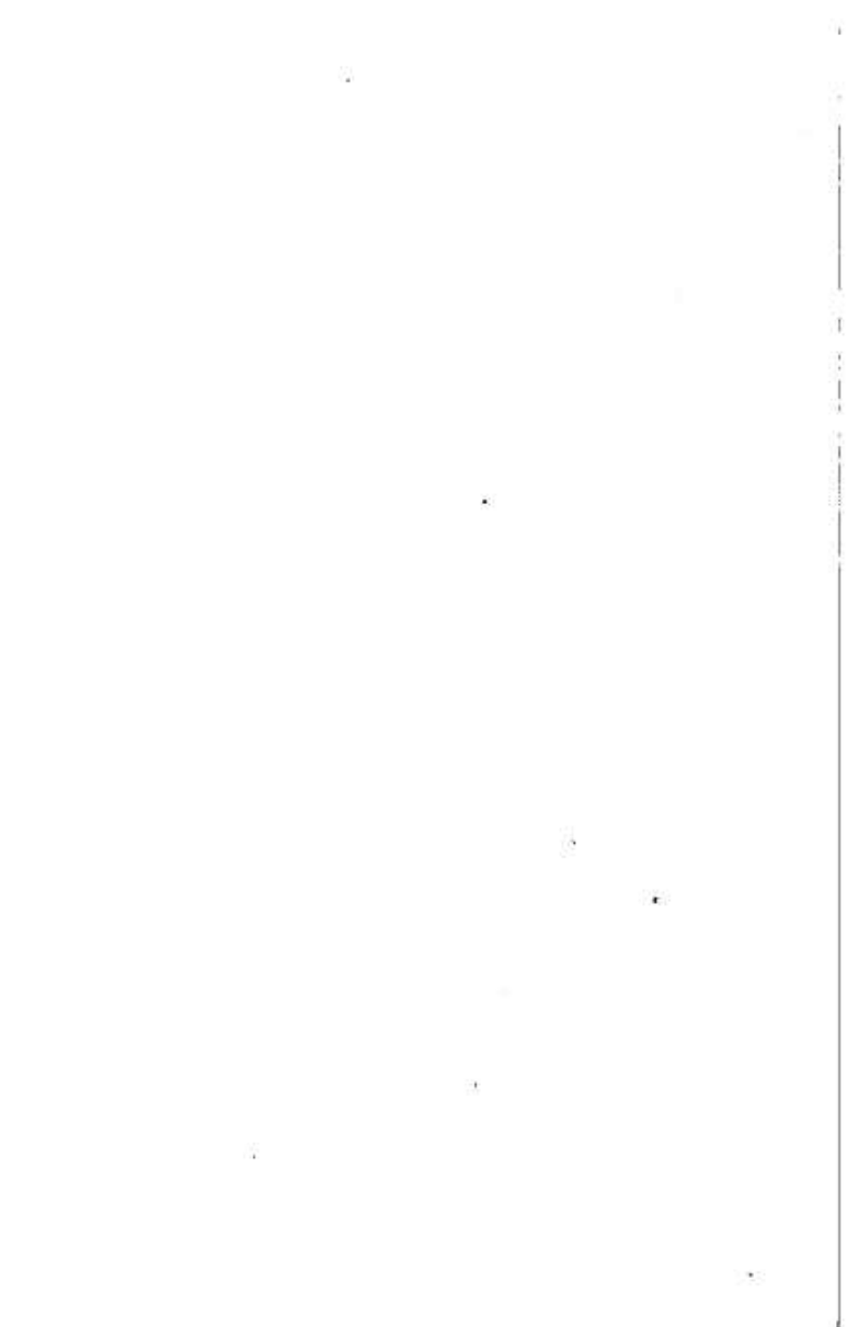
Figure 1: Percentage of respondents who are 'Very satisfied' or 'Satisfied' with their lives, broken down by age group and gender.