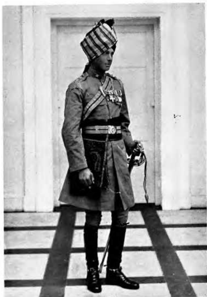
H.R.H. THE PRINCE OF WALES IN INDIAN CAVALRY UNIFORM