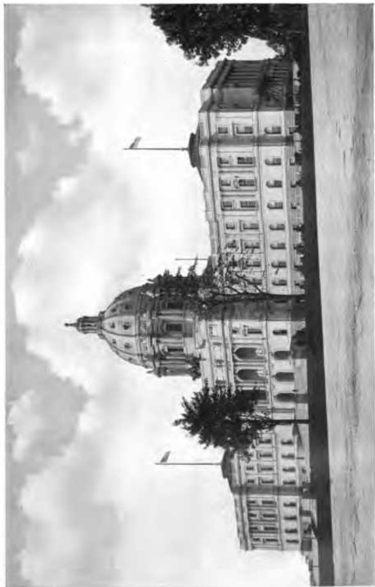
STATE CAPITOL—SOUTH AND EAST FACADES