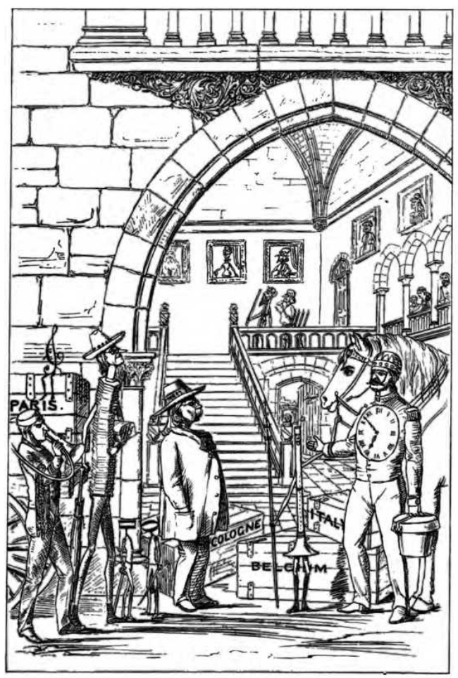
RETURN OF TIME TO MUSIC-LAND