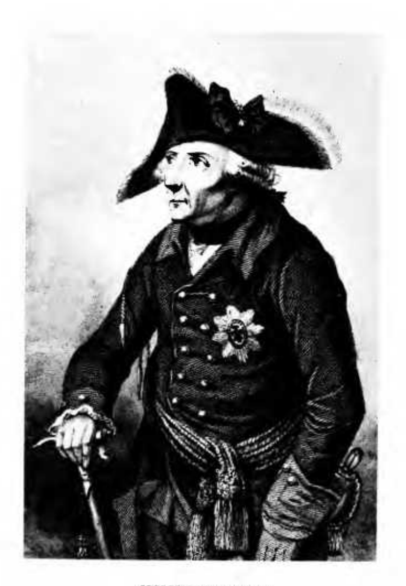
FREDERICK THE GREAT.