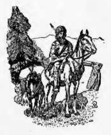
New York Forest and Stream Publishing Co.

With Eight Full-Page Illustrations By Charles M. Russell