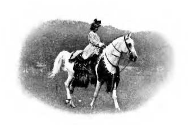
DEDICATED TO MY DAUGHTER MILDRED