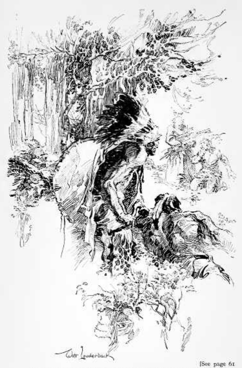
HE HAD THE UNCANNY FEELING OF BEING WATCHED